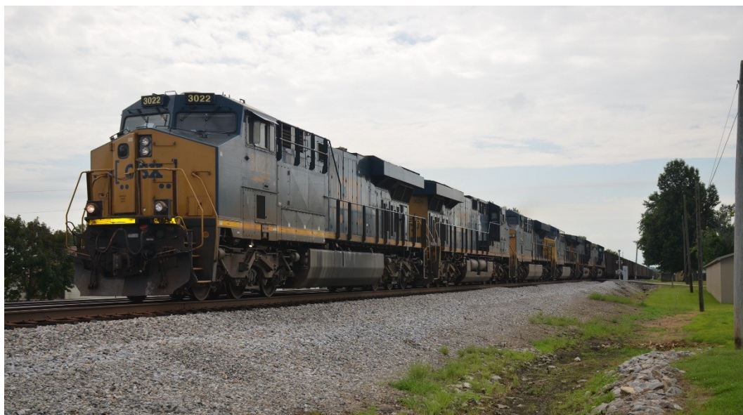
Right: Again at Crofton, 5 minutes behind the CN unit above, CSX locomotive 2513 in the lead being assisted by an additional 5 CSX units in order to pull the 10,841 foot, 900 axle, 2 1/2 mile-long empty coal train. Statistics by Steve Miller.