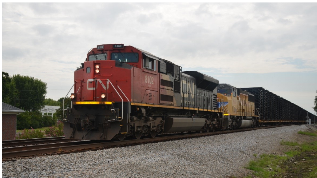
Left: At Crofton (KY) a North bound mixed freight (is) pulled by Canadian Nation unit 8102 and assisted by Union Pacific 2513. The train lost its air and went into an emergency stop just North of Kelly, KY.